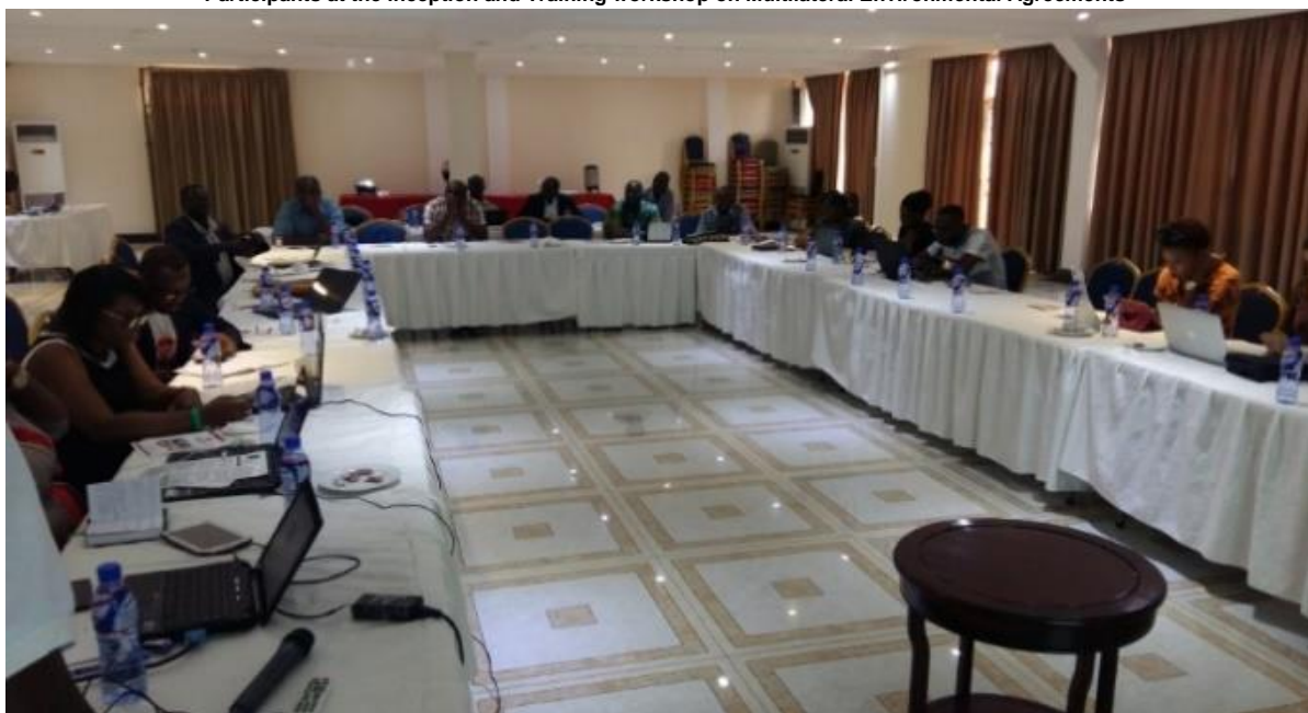
Collaborative Workshop on Multilateral Fund