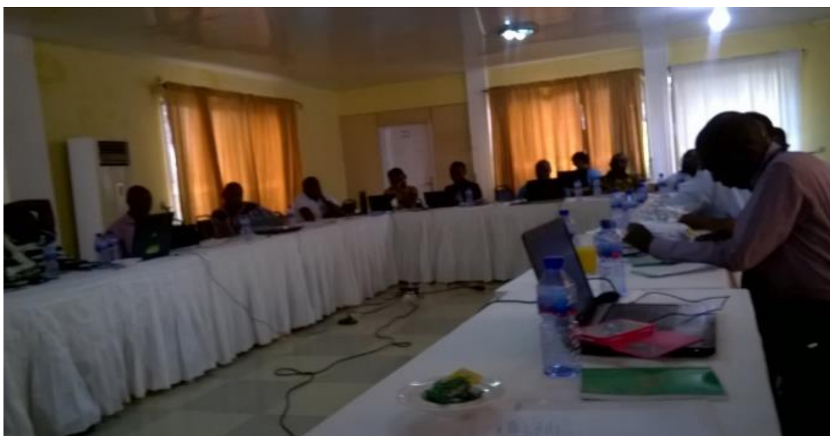
Media Capacity Building and editor's forum