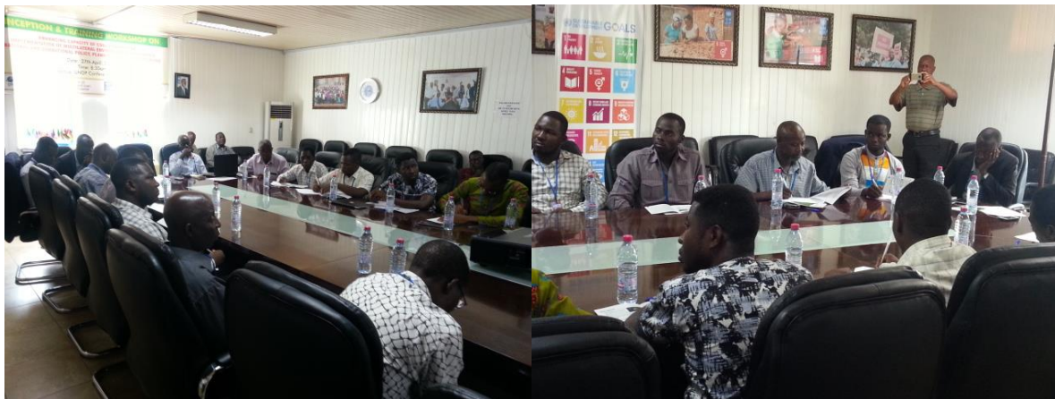
Participants at the inception and Training workshop on Multilateral Environmental Agreements