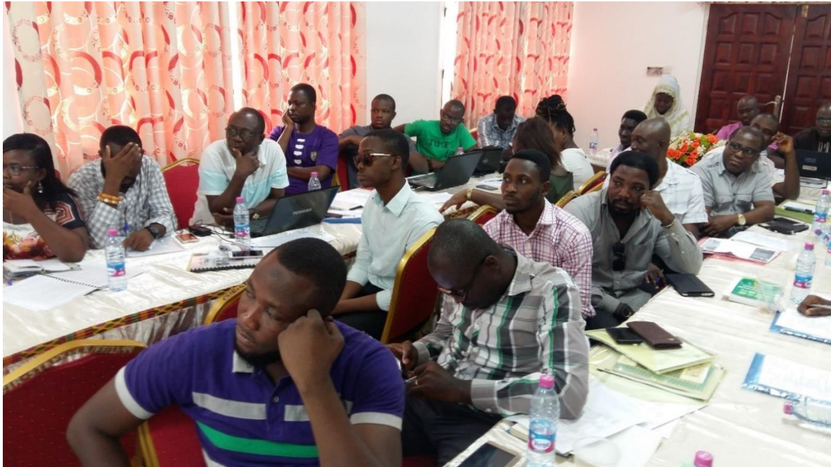
Participants at the second Training workshop on Multilateral Environmental Agreements