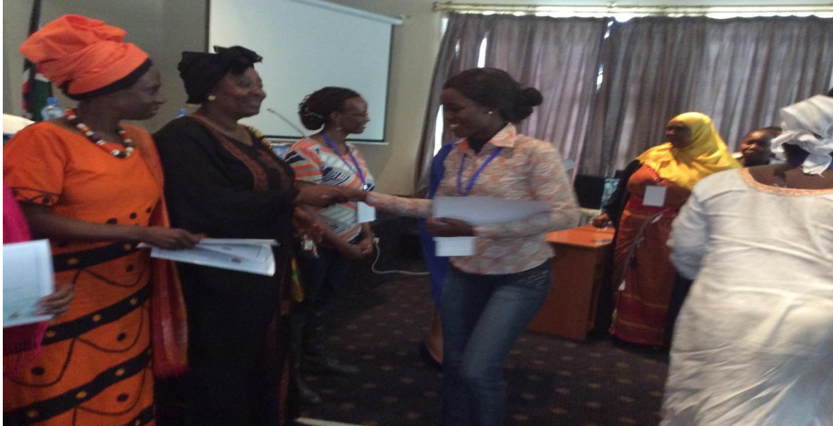
Deputy CEO receiving her certificate at the end of training on Transformational Leadership for Women in Agribusiness